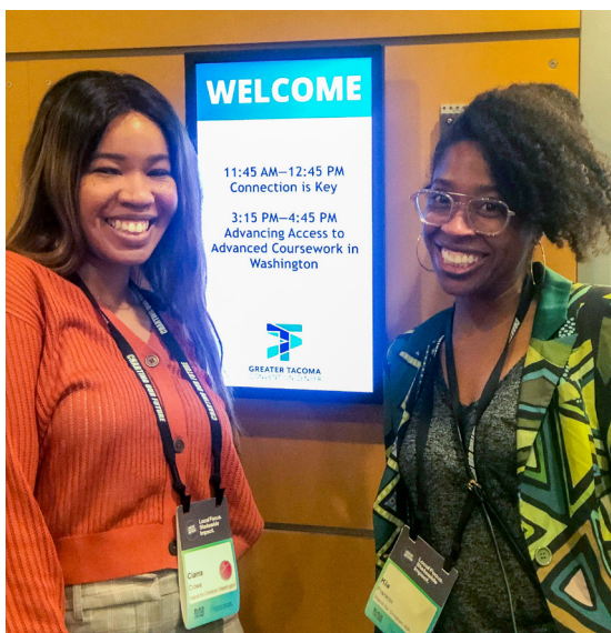
WA Team attending the Graduate Tacoma Conference