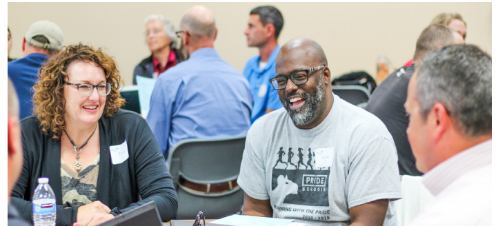
Ninth Grade Success team members planning together.

Stand for Children Washington has emphasized and advocated for the Ninth Grade Success Initiative since 2019, when the state legislature funded the program’s five-school pilot. A partnership between the Center for High School Success (CHSS) and the state’s Office of the Superintendent of Public Instruction (OSPI), the Ninth Grade Success Initiative helps schools implement proven systems and strategies to reduce disparities and boost state 9th Grade On-Track rates (the rates at which students are on-track for on-time graduation as of the end of their ninth grade year). Because of the importance of ninth grade, this work is one of the most significant and impactful ways we can increase graduation rates and close opportunity gaps.