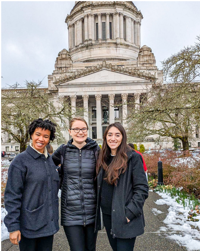
Stand Washington team members at State Capitol Building in Olympia, Washington February 2024

"The collaboration between Stand WA and CHSS has transformed our approach to advocacy, making it more succinct, intentional, and effective. This partnership has proven to be a game changer, demonstrating that together we are not only better but also stronger in our efforts. By working hand in hand, we have created meaningful change and amplified our voices for a greater impact."