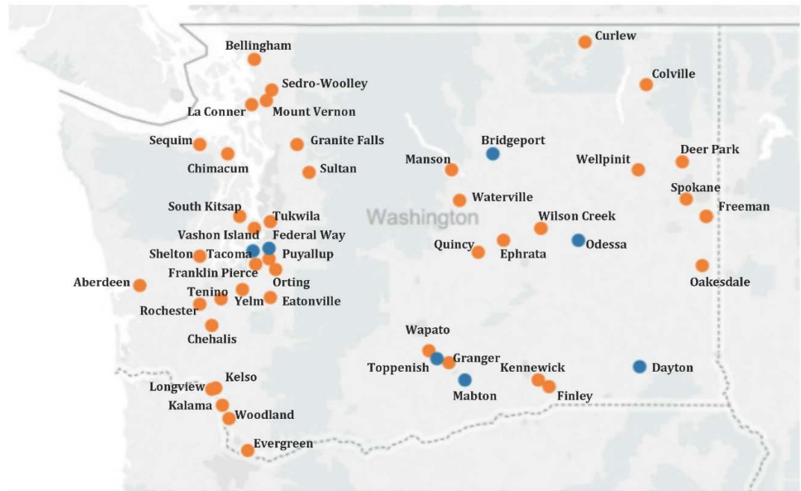
Washington School Districts that Have Adopted Academic Acceleration (AAP)